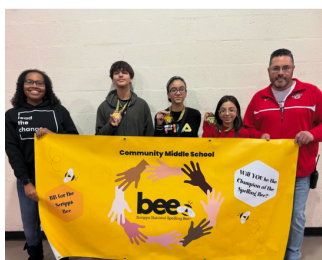
Community Middle School Spelling Bee Champions