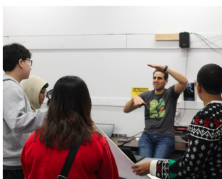
BBHS Robotics Team "Kickoff" the new Season