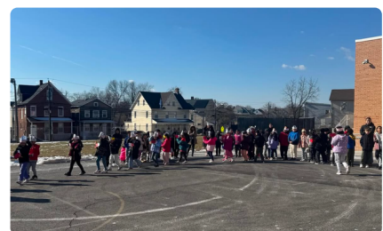
Lafayette Celebrates the Lunar New Year