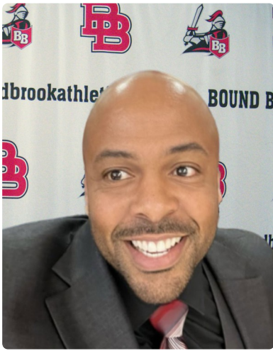
Superintendent of Schools

That's why BBSD has a zero-tolerance policy for bullying in school or online. You can read our district's Harassment, Intimidation, and Bullying policy online and report any inappropriate behavior through the HIBster portal . Anyone can anonymously report an incident, and then an anti-bullying specialist or administrator will follow up on the report.