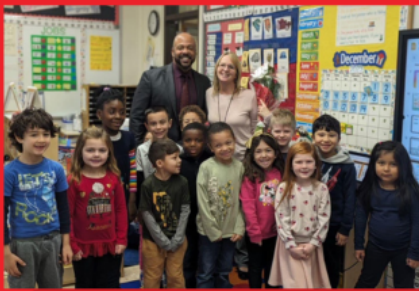
TEACHER & SPECIALISTS OF THE YEAR - Bound Brook School District -