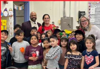
TEACHER & SPECIALISTS OF THE YEAR - Bound Brook School District -

Specialist of the Year LaMonte/LaMonte Annex