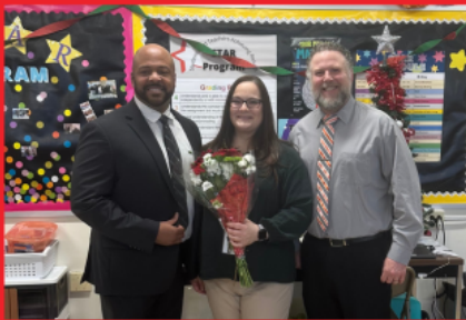
TEACHER & SPECIALISTS OF THE YEAR - Bound Brook School District -