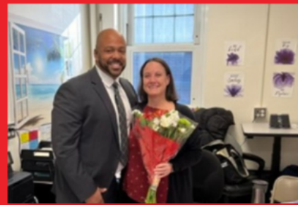
TEACHER & SPECIALISTS OF THE YEAR - Bound Brook School District -