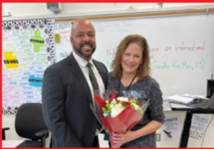
TEACHER & SPECIALISTS OF THE YEAR - Bound Brook School District -