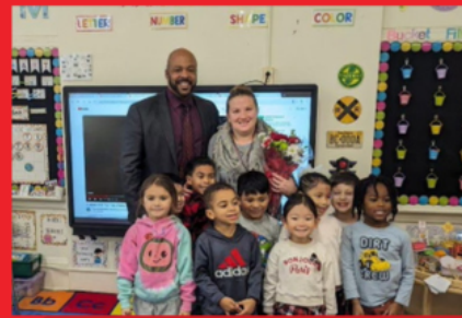
TEACHER & SPECIALISTS OF THE YEAR - Bound Brook School District -

Teacher of the Year LaMonte/LaMonte Annex