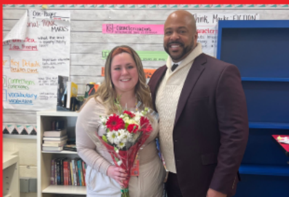
TEACHER & SPECIALISTS OF THE YEAR - Bound Brook School District -