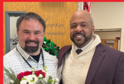
TEACHER & SPECIALISTS OF THE YEAR - Bound Brook School District -